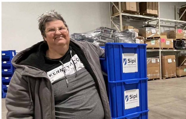
Partnership with Sipi Asset Recovery – Chicagoland