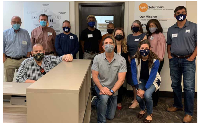
Advance+ Program for Workforce Inclusion (photo of Apto Solutions and Marietta City Schools, Atlanta, GA)