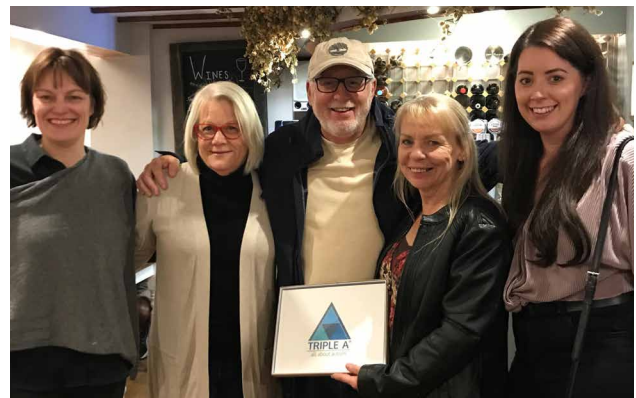
Workforce Inclusion Project – Cumbria, UK

See full stories of these major milestones at www.bluestarrecyclers.org